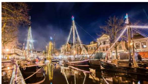
Hoge/Lage der A around christmas

This street is a well known street and the most photographed street of the city! Here you will find 28 state monuments and 11 municipal monuments