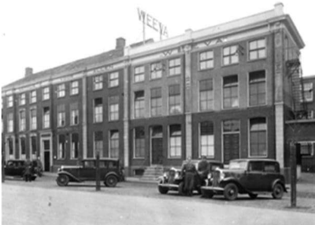
WEEVA around 1933

Between 1930 and 1933 more facilities were build, like a laundry facility and the number of rooms went up from 26 to 110